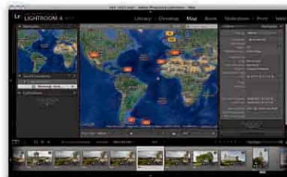
The Map module and Navigation [pdf]