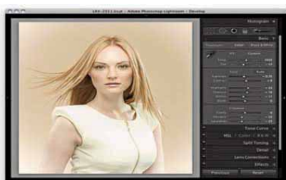
RGB Curves [pdf]