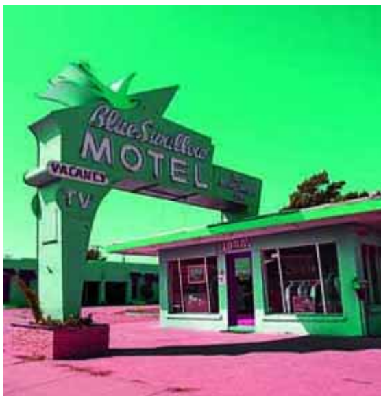
Using the HSL controls to reduce gamut clipping [pdf]