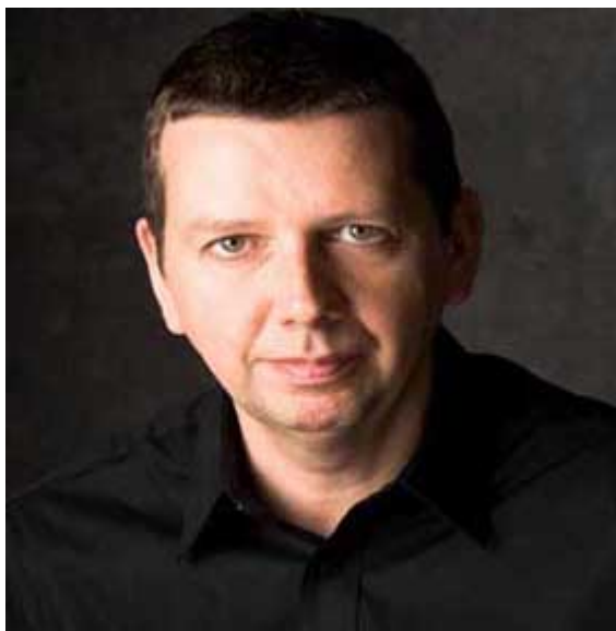
Interview with Martin Evening, author of The Adobe Photoshop Lightroom 4 Book